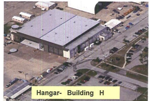
Hangar- Building H

Recommended Commercial Vehicle Driving Center Budget Est. $4,273,600