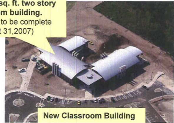
New Classroom Building

New 46,000 sq. ft. two story classroom building. (Scheduled to be complete August 31, 2007)